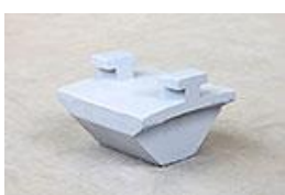
Circum Guard plate